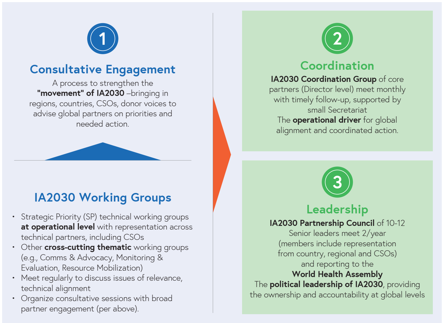
Figure 1: The IA2030 partnership model at global level

Working together, these components address a critical gap in the overall O&A structures aligned to the decade's new vision and strategy. The intent is to bring together needed and varied types of commitments (technical capacity, advocacy and financial) from technical workstreams, broad consultations, operational coordination and senior leadership to drive required actions at global level to achieve the IA2030 vision.